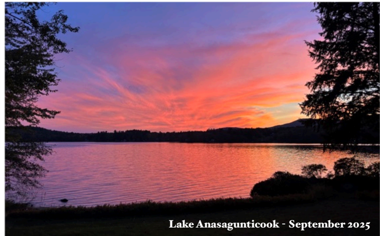
Lake Anasagunticook - September 2025

The number indicates the year the director's term ends in August.