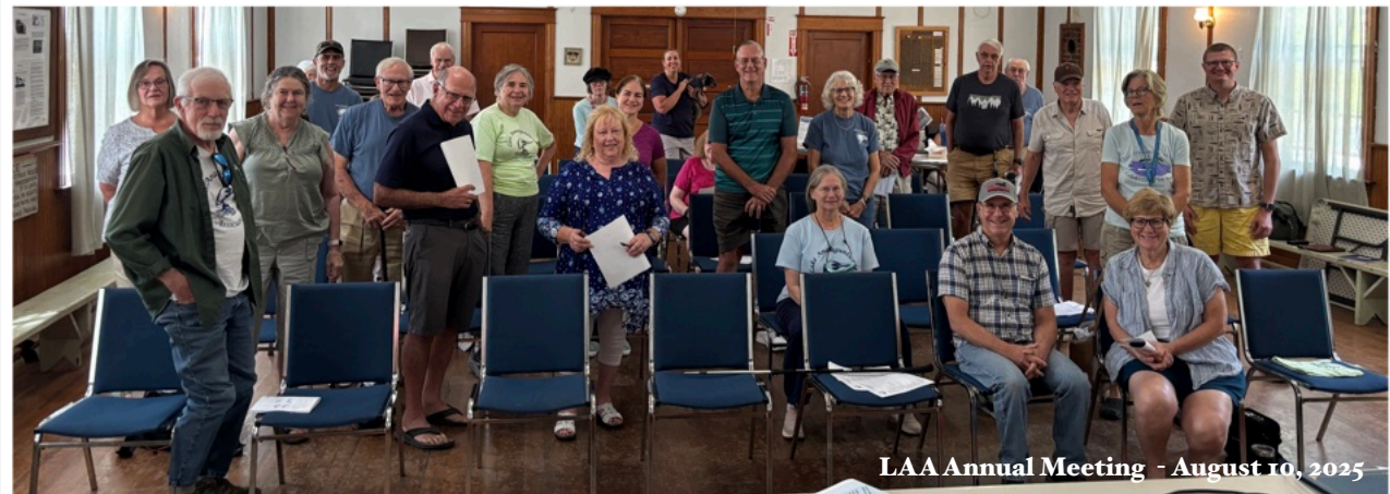
LAA Annual Meeting - August 10, 2025

Please forward the completed this survey to membership@lakeanasagunticook.org or mail it to LAA Membership Committee, PO Box 411, Canton, ME 04221. Your response is greatly appreciated.