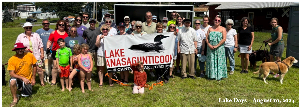
Lake Days - August 10, 2024

My thanks to those of you who had the desire and time to devote to our association over the years. Although my schedule did not permit me to serve, I greatly appreciate those of you who have. Keeping our lake as pristine as possible for future generations is a gift for all of us.