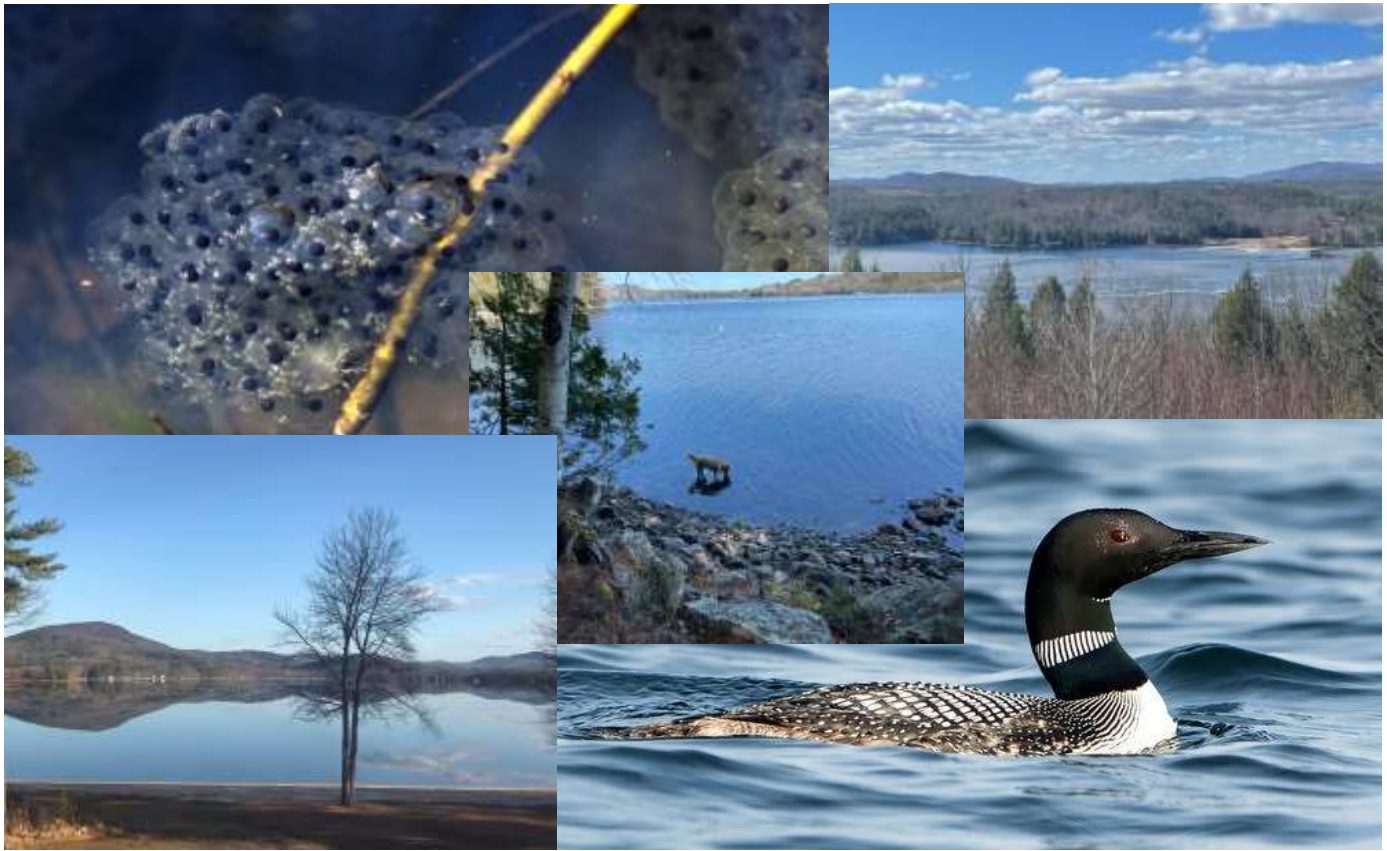
Assorted photo credits