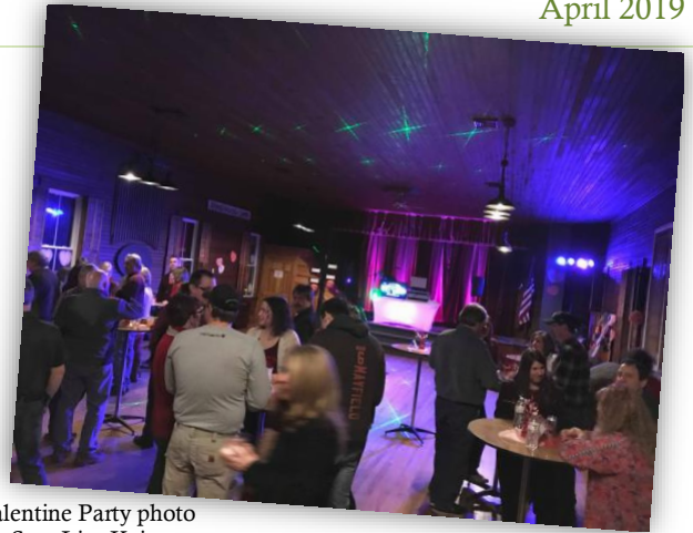
Valentine Party