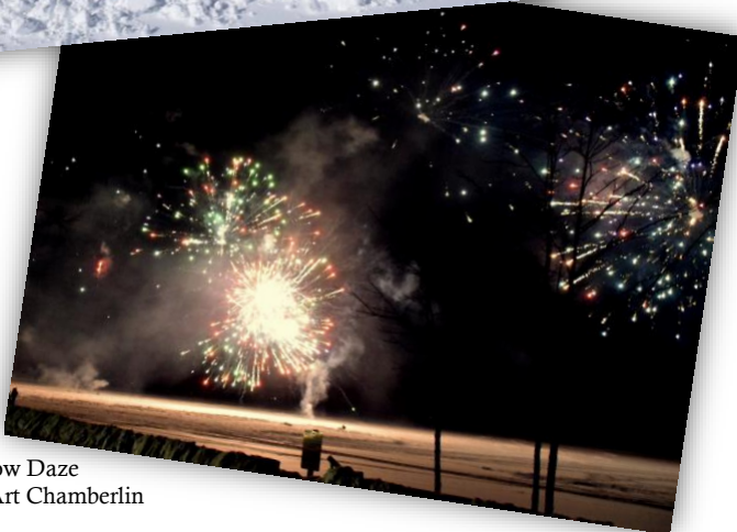
Canton Snow Daze